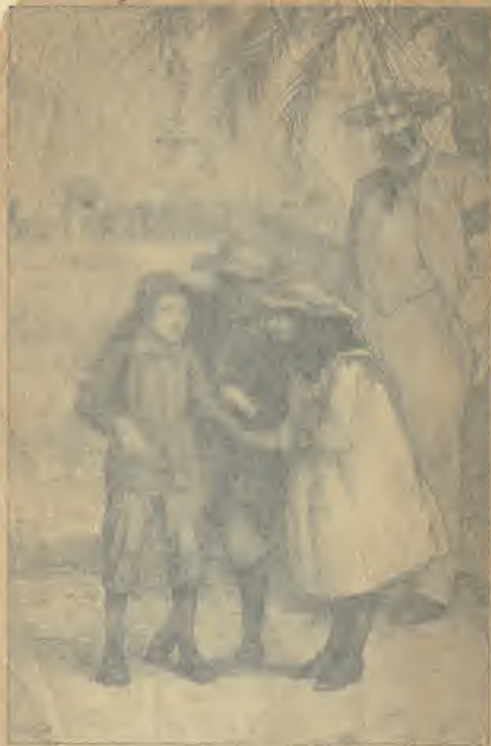
"Happy" and Mrs. "Happy" with "Happy" and "Happy"